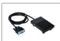
foot switch (optional)