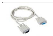
RS232 cable (optional)