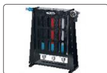
air filter (optional)